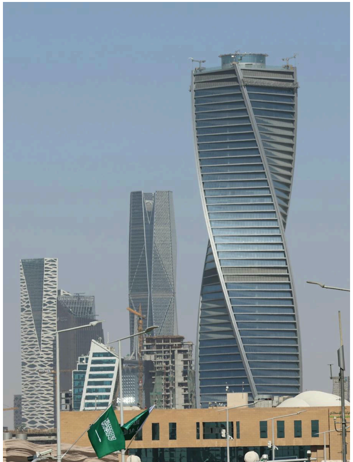
Saudi growth context: the route must match the commercial ambition.

Dar El Wasl is built around that first judgment. We slow down the part that should not be rushed, then move the execution through a controlled written path.